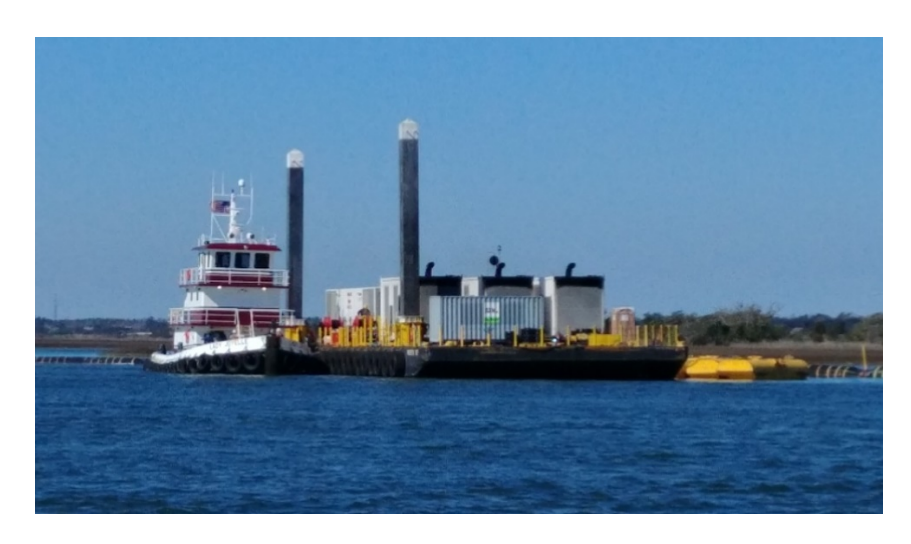
For More Information

Please be sure to visit our website at <a href="www.topsailbeach.org">www.topsailbeach.org</a> and look for the icon below for more information. There are pictures and videos from the various stages of the project, with more to come. Also watch for us on Facebook and Twitter!